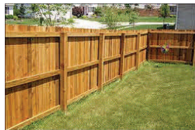
Wood/Vinyl Privacy, Side or Rear Yard

Use the images below to choose the correct fence design for the proposed fence location on your property.