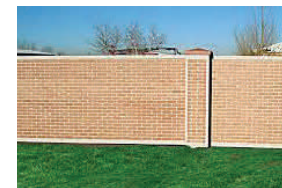
Brick/Stone Privacy Wall, Side or Rear Yard