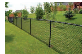
Chain Link, Side or Rear Yard